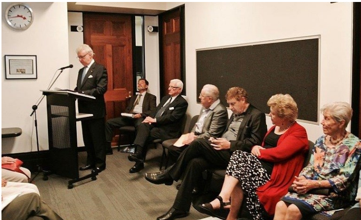
The Governor addressing the Book Launch audience