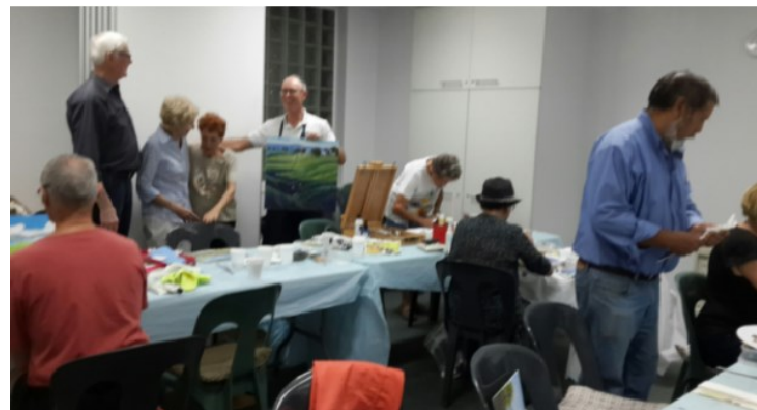
The budding artists hard at work and having a good time