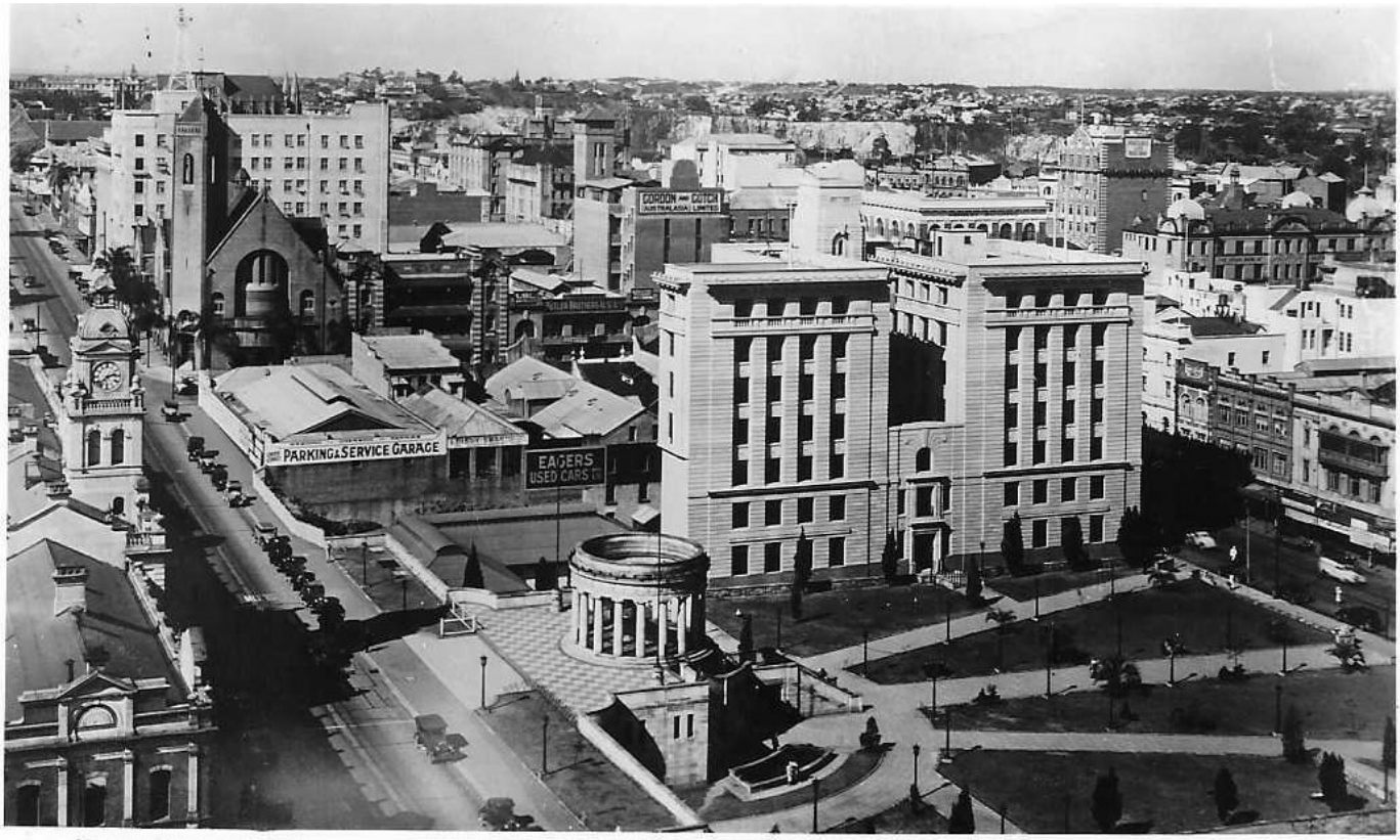
SIDUES SERIES No. 637 COPYRIGHT