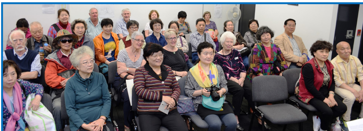
Group of U3A Members from China with U3A Brisbane members