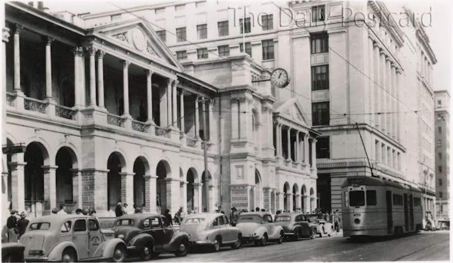
SIDUES SERIES No.1390