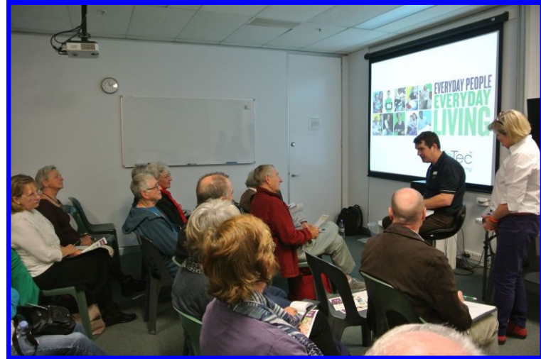
Winter School supporter Lifetec at a well attended session