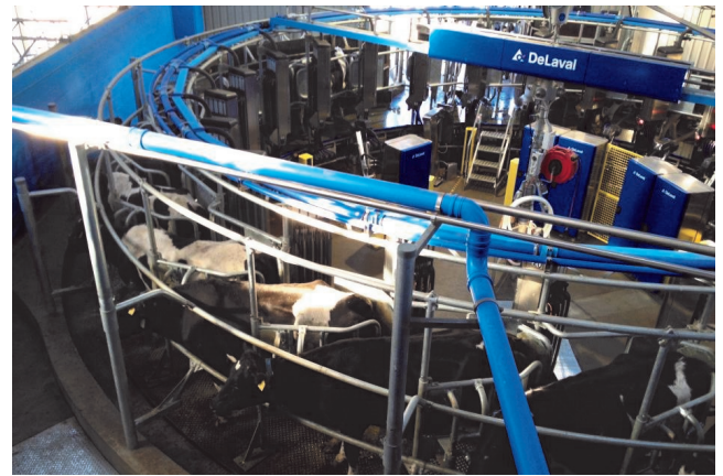
The picture above shows part of the Robot Dairy in action.

We have only 6 seats left for this excursion with Cross Country Tours on Friday June 20th. It is great value at $50.00 for the visit, morning tea and lunch. See page 3 of the Term 2 class Schedule for more information. The bus leaves from Roma St ( outside ) the Transit Centre at 8:00am then picks up again at Kessels Rd Macgregor Park & Ride at 8:30am. It should be an interesting day.