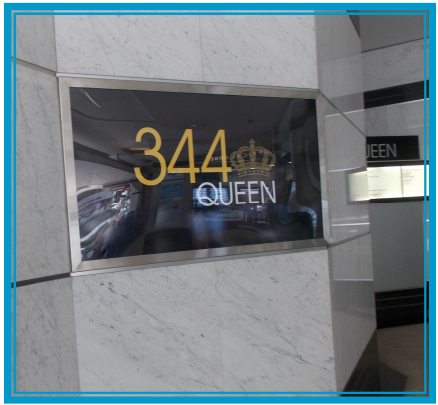
The building number is shown prominently at street level.

344 Queen St is an additional address we now have for U3A. Two large rooms have been rented on the first floor of these premises. During the week I went into the City to check out where the building is and the various facilities that are available in the immediate vicinity.