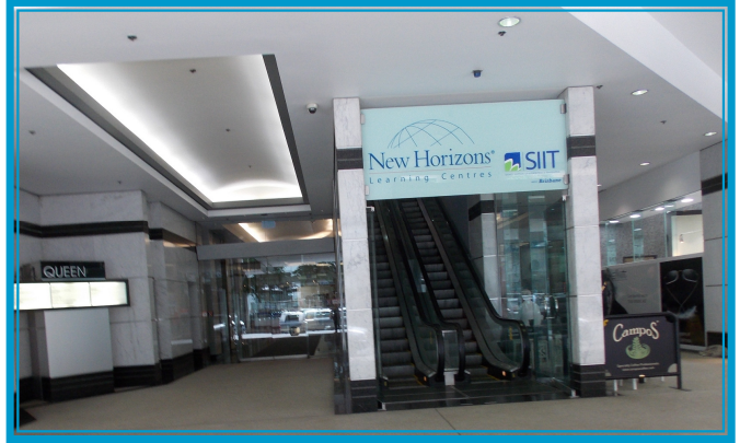
From street level, escalators take you up to the first floor entrance to the U3A rooms.